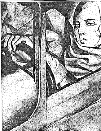
The Lady in Gray is waiting to greet you January 11 - 14 at the Bellevue Red Lion Inn.

You may attend one or all events but please be sure to register. Registration will be open from 3:00 on Wednesday until 12:00 on Saturday.