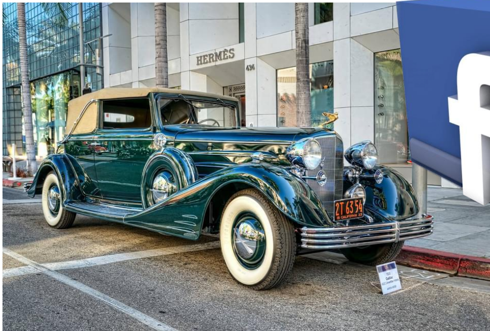
1933 Cadillac V16

Find us on Facebook: www.facebook.com/CCCA.PNR